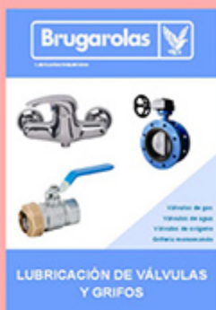
Valves and taps