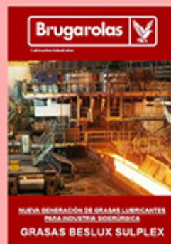
Beslux Sulplex greases