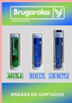
Cartridges of grease